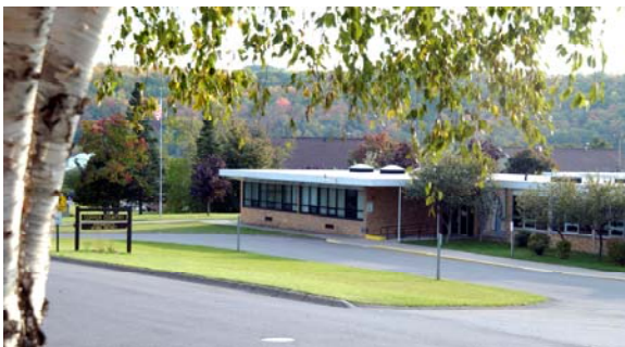
Our 809 Hecla Street facility in Hancock.